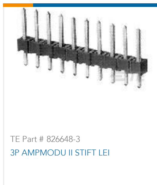
TE Part # 826648-3 3P AMPMODU II STIFT LEI