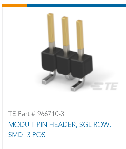
TE Part # 966710-3 MODU II PIN HEADER, SGL ROW, SMD-3 POS