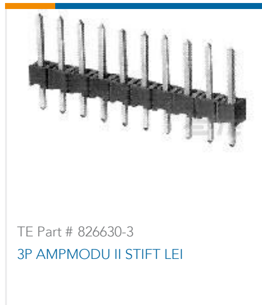
TE Part # 826630-3 3P AMPMODU II STIFT LEI