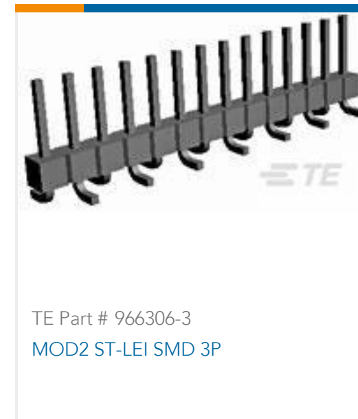
TE Part # 966306-3 MOD2 ST-LEI SMD 3P