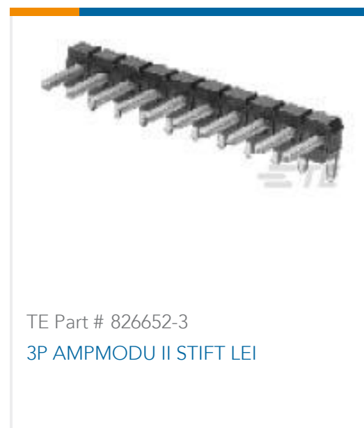
TE Part # 826652-3 3P AMPMODU II STIFT LEI