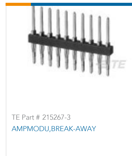
TE Part # 215267-3 AMPMODU, BREAK-AWAY