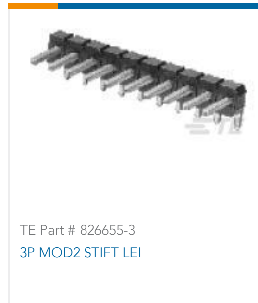
TE Part # 826655-3 3P MOD2 STIFT LEI