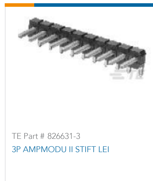
TE Part # 826631-3 3P AMPMODU II STIFT LEI