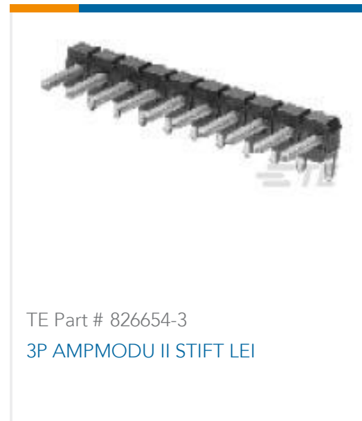
TE Part # 826654-3 3P AMPMODU II STIFT LEI