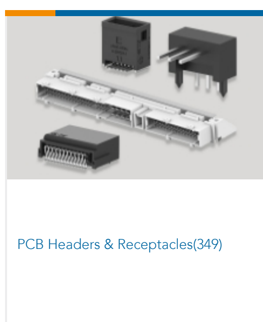
PCB Headers & Receptacles(349)